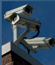
Page 4 - CCTV