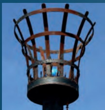
Page 2 - Beacon