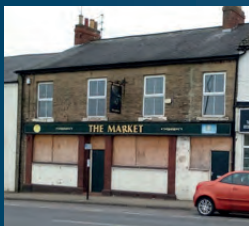
Page 2 - New Offices