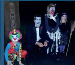
Page 8 - Scary winners