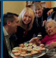
Page 10 - Care Village