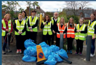
Page 3 - South Dene Clean Up