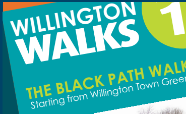
Page 2 - New Walk Leaflets