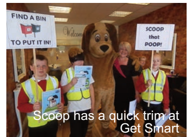
Scoop has a quick trim at Get Smart

Greater Willington Town Council sold 10,000 dog bags in 2013-2014. The dog bags sold out before the end of the financial year so we increased the order to 16,000 for 2014-2015.