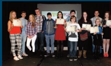
Page 6 - Children & Young Peoples Award Winners