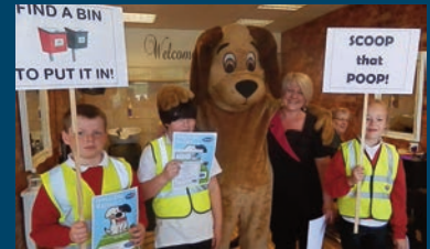
Page 5 - Scoops day out