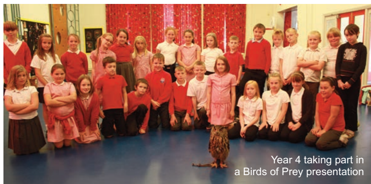
Year 4 taking part in a Birds of Prey presentation

Willington Primary School had a visit from the Ofsted school inspection and advisory service on the 29th and 30th May.