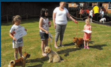
Page 9 - Willington Care Village