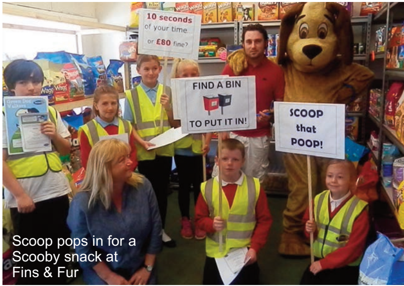
Scoop pops in for a Scooby snack at Fins & Fur