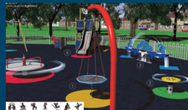
New Play Area